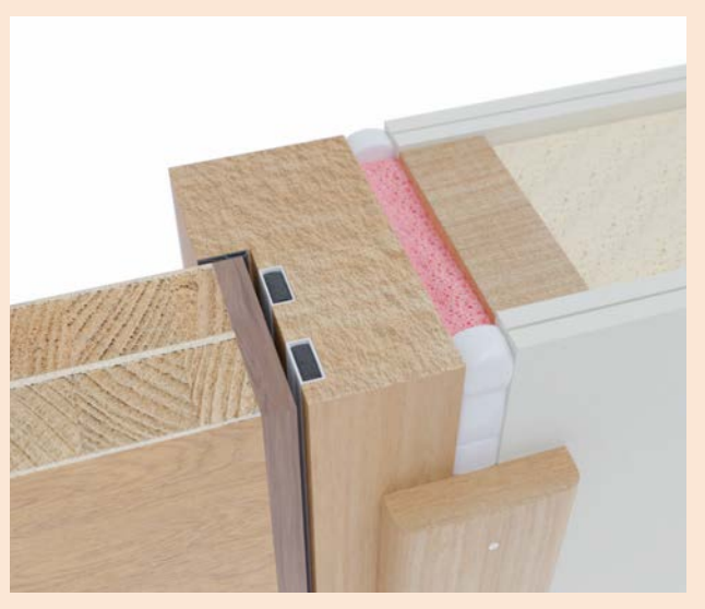
Image B – Intumescent sealant with Fire & Acoustic Seals Fire Door Foam™ for joint widths up to 25mm to achieve ratings of up to 120 minutes when applied correctly.