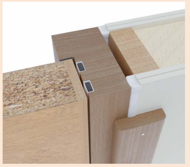
Image A – Intumescent sealant for joint widths up to 5mm require no backing.